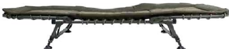
T3913 Indulgence Air-Lite 2 RRP £208.99

Dimensions: (Frame) 196cm(l) X 72cm(w) Leg length extension: 22-28cm Weight: 7.7kg