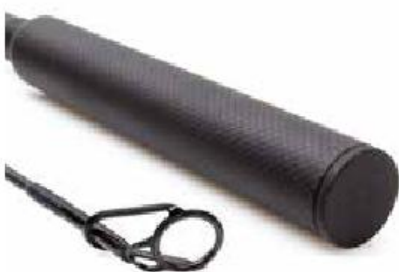
T1700 Scope Black Ops 9' 3lb

Scope Black Ops 9' pack down size 44" (approx. 112cm) Scope Black Ops 10' pack down size 50" (approx. 127cm)