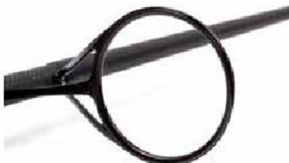
T1701 Scope Black Ops 9' 3.5lb