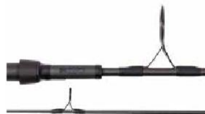
T1702 Scope Black Ops 9' 4.5lb