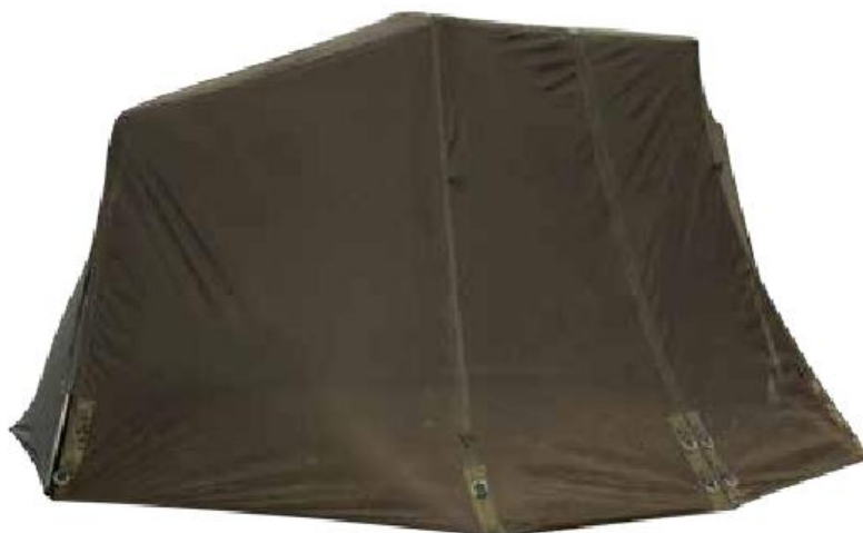
T3905 Scope Recon Brolly Mozzi Throw RRP £43.99

This dedicated Mozzi Throw is tailored to fit our Scope Recon and Scope Black Ops Recon Brollies. Attaching quickly around the bell cap with an elastic loop and tensioned to the brolly frame through two fast moulded clips, the Brolly Mozzi Throw pegs down to fully protect you from biting insects day and night. An essential accessory for hot, humid, bug filled summer sessions.