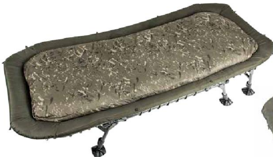
T9225 Indulgence Mattress Sheet Standard RRP £25.99

Keep your mattress in pristine condition by fitting one of our washable Indulgence Mattress Sheets. Features corresponding Velcro attachment to secure the sheet to the removable mattress as well as to the mattress base. Compatible with our full range of Indulgence Air Frames and Airbeds.